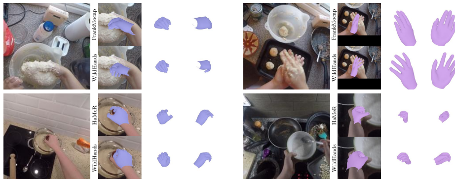
Fig. 5: Failure cases. We observe that images with (top) barely visible fingers, e.g. kneading dough or (bottom) extreme grasp poses are challenging for all models.