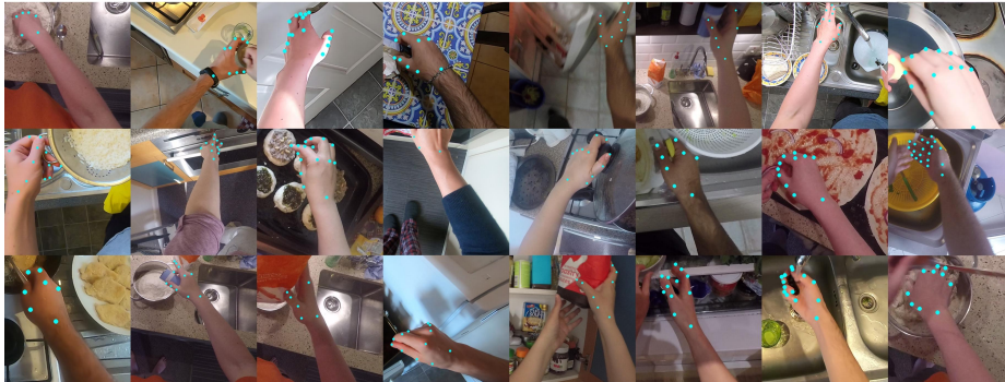
Fig. 3: Epic-HandKps annotations. We collect 2D joint annotations (shown in blue) for 5K in-the-wild egocentric images from Epic-Kitchens [8]. We show few annotations here with images cropped around the hand. We also have the label for the joint corresponding to each keypoint. Note the heavy occlusion & large variation in dexterous poses of hands interacting with objects. More visualizations in supplementary.

available in the VISOR split of Epic-Kitchens and 45K images from Ego4D. To extract hand masks and grasp labels, we use off-the-shelf model from [6].