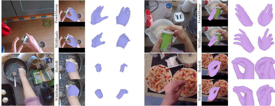
Fig. 1: WildHands predicts the 3D shape, 3D articulation and 3D placement of the hand in the camera frame from a single in-the-wild egocentric RGB image and camera intrinsics. It produces better 3D output compared to FrankMocap [59] in occlusion scenarios and is more adept at dealing with perspective distortion than HaMeR [52], in challenging egocentric hand-object interactions from Epic-Kitchens [9] dataset.

with a made-up focal length. These choices are reasonable for exocentric settings where the location of the hand in the image does not provide any signal for the hand articulation; and perspective distortion effects are minimal as the hand is far away & occupies a relatively small part of the camera’s field of view. However, these assumptions are sub-optimal for processing egocentric images.